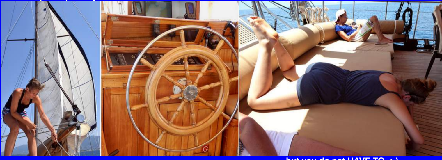
... but you do not HAVE TO ;-)