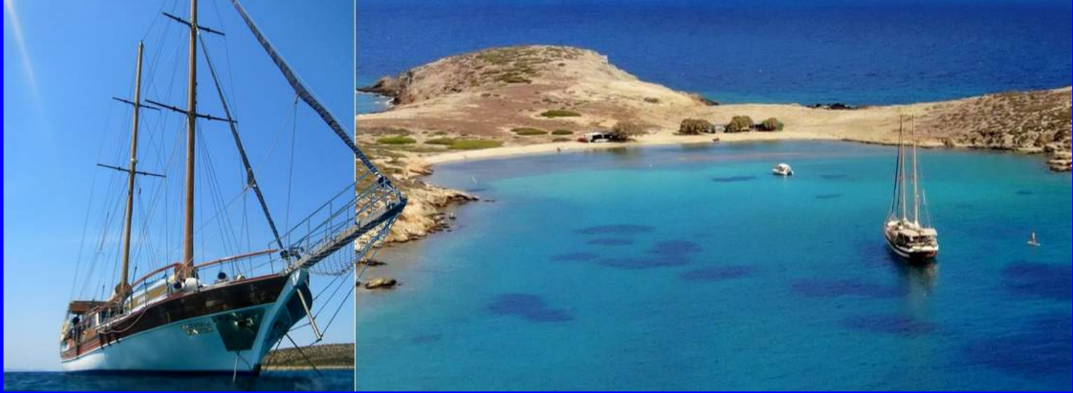
Kayak, sup-paddle, snorkeling equipment to enjoy the best places...