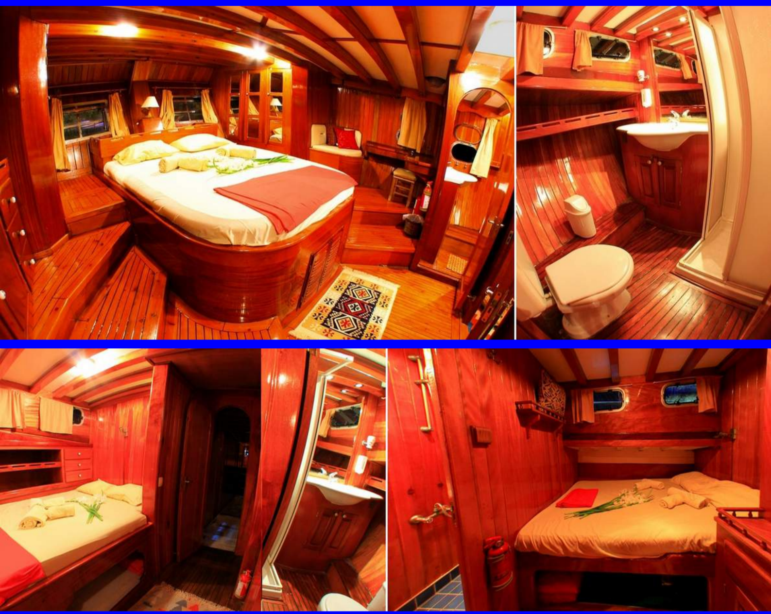
All other SUP cabins have a 160 cm wide bed and a shower box, except the A cabin.