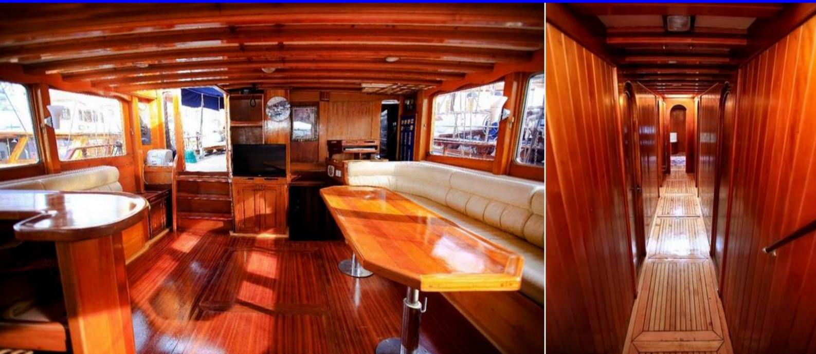
You can participate if you wish...